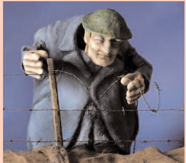
The Vertigo of Sheep by Thingumajig Theatre