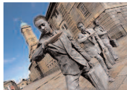
One Small Step at Barbican Theatre Plymouth

Buchanan Theatre Company C&T Caboodle Theatre in Education Cahoots NI Cambridge Touring Theatre CandoCo Dance Company Caravanserai Productions and Acting Studio