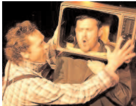
My Life with the Dogs by NIE

New International Encounter (NIE) Nightingale Theatre (The) Nimble Fish Nitro Non Stop Cabaret Theatre Company North Star Opera Northern Firebrand Norwich Puppet Theatre Northumberland Theatre Company (NTC) Nuffield Theatre Ocean Theatre Company Ockham's Razor Off The Cuff Theatre Company Oily Cart Open Clasp Theatre Company Openwide Theatre Opera Circus Opera Restor'd Other Way Works (The)