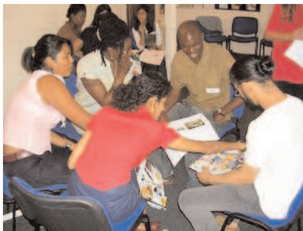
BAME Fast Track Selection and Induction Day - July 2007