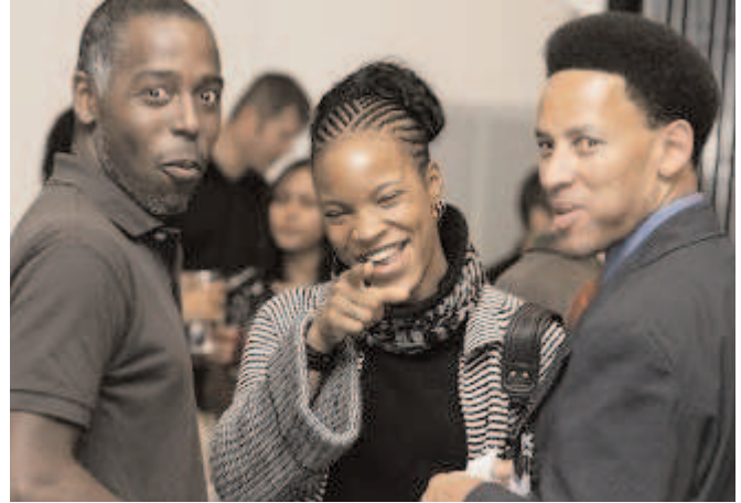
GAIN Launch at London City Hall - September 2007

The new ITC/Equity Agreement with its increased flexibility has enabled more ITC organisations to operate union recognised terms and conditions and has simplified the process of managing for companies. Only two disputes with the Union have