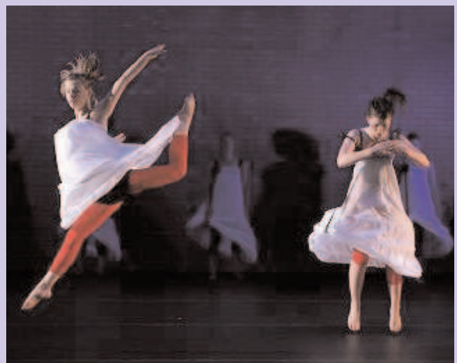
Freefall at RSAMD, Glasgow by YDance (Project Y 2008)