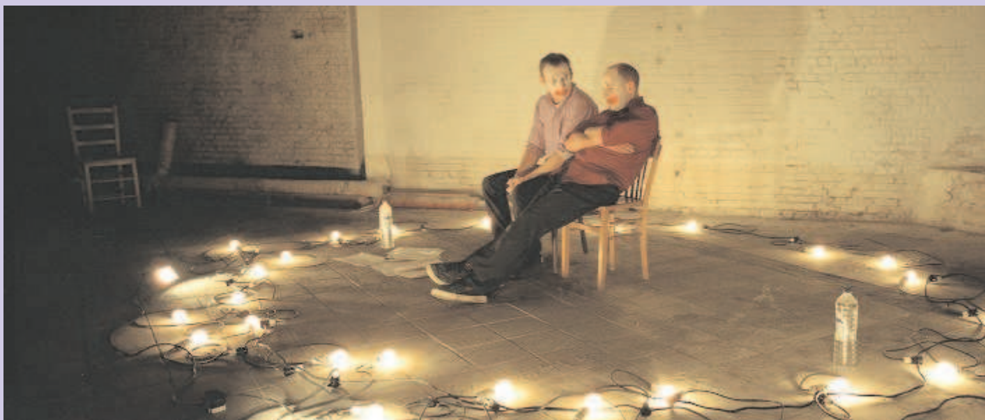
Quizoola! by Forced Entertainment

One piece of learning for me and for ITC from this rollercoaster ride was the importance of not over-focussing on Arts Councils and their policies. We can expend valuable energy trying to second guess what will happen only to respond negatively when decisions are finally made. Many of ITC's members do not receive money from these bodies anyway. Less than 25% of ITC's members are regularly funded organisations. We recognised that it is essential to broaden our perspective and to seek