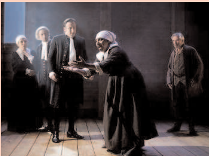
Y Pair (Arthur Millers' The Crucible) by Theatr Genedlaethol Cymru

By engaging in solving the detailed problems of our members and by working to remove the practical barriers to their success, ITC is uniquely placed to understand the sector's needs and aspirations. At the end of the year we used this position to communicate directly with government through a delegation to the New Secretary of State, Andy Burnham, where we were able to raise vital issues affecting our members and to convey strongly the potential of the independent performing arts.