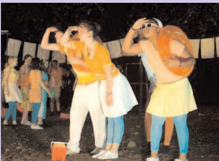
Urban Dreams by London Bubble

We also engaged with members across the UK holding regional meetings in Bath, Edinburgh, Manchester, Cardiff, Birmingham and York.