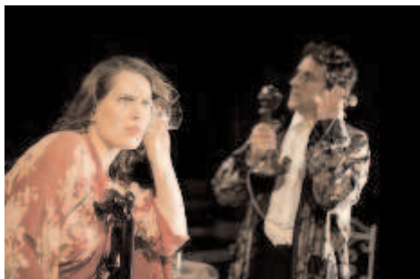
Crampons of Fear by Eastern Angles

Changing Faces Theatre Company Cholmondeleys and Featherstonehaughs Circus Arts Forum Circus Space (The) Classworks Theatre Clean Break Theatre Company Clio's Company