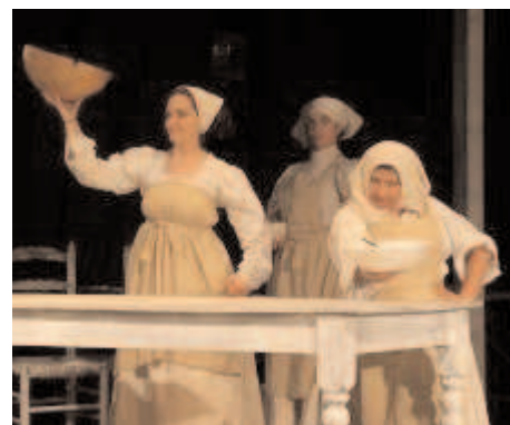
Como Agua Para Chocolate by Theatre Sans Frontieres