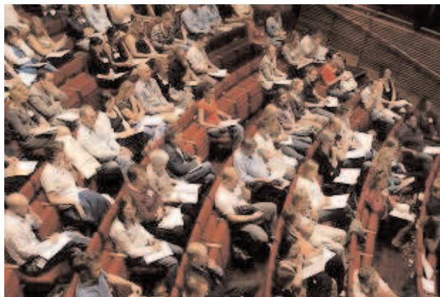
Delegates at the ITC Summer Conference at Hampstead Theatre - June 2007

As the dust began to settle and some good news about new funding relationships emerged the sector found its feet again. Many of the cut companies behaved with extraordinary resourcefulness and found ways to continue their work (only 3 ITC member companies had been forced to close completely by the end of the year).